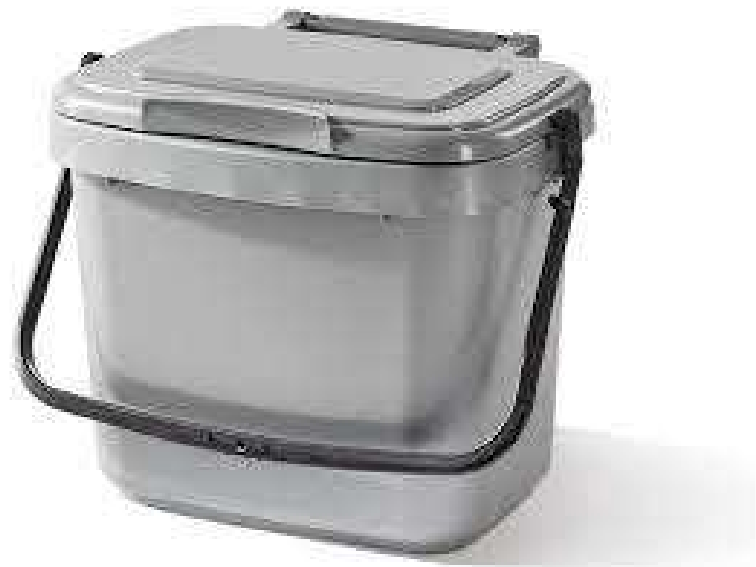
5l Kitchen Caddy