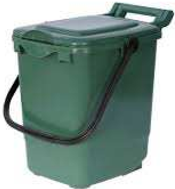
23l Food Caddy