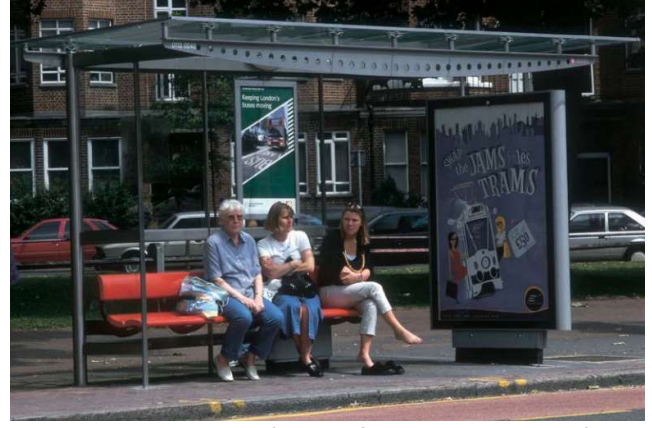
Premium bus shelter (image for illustration only)