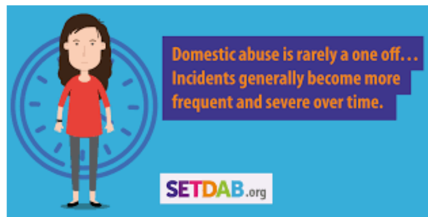
Estimated Socio-Economic Cost of Domestic Abuse Across Southend, Essex & Thurrock, 2016-2017