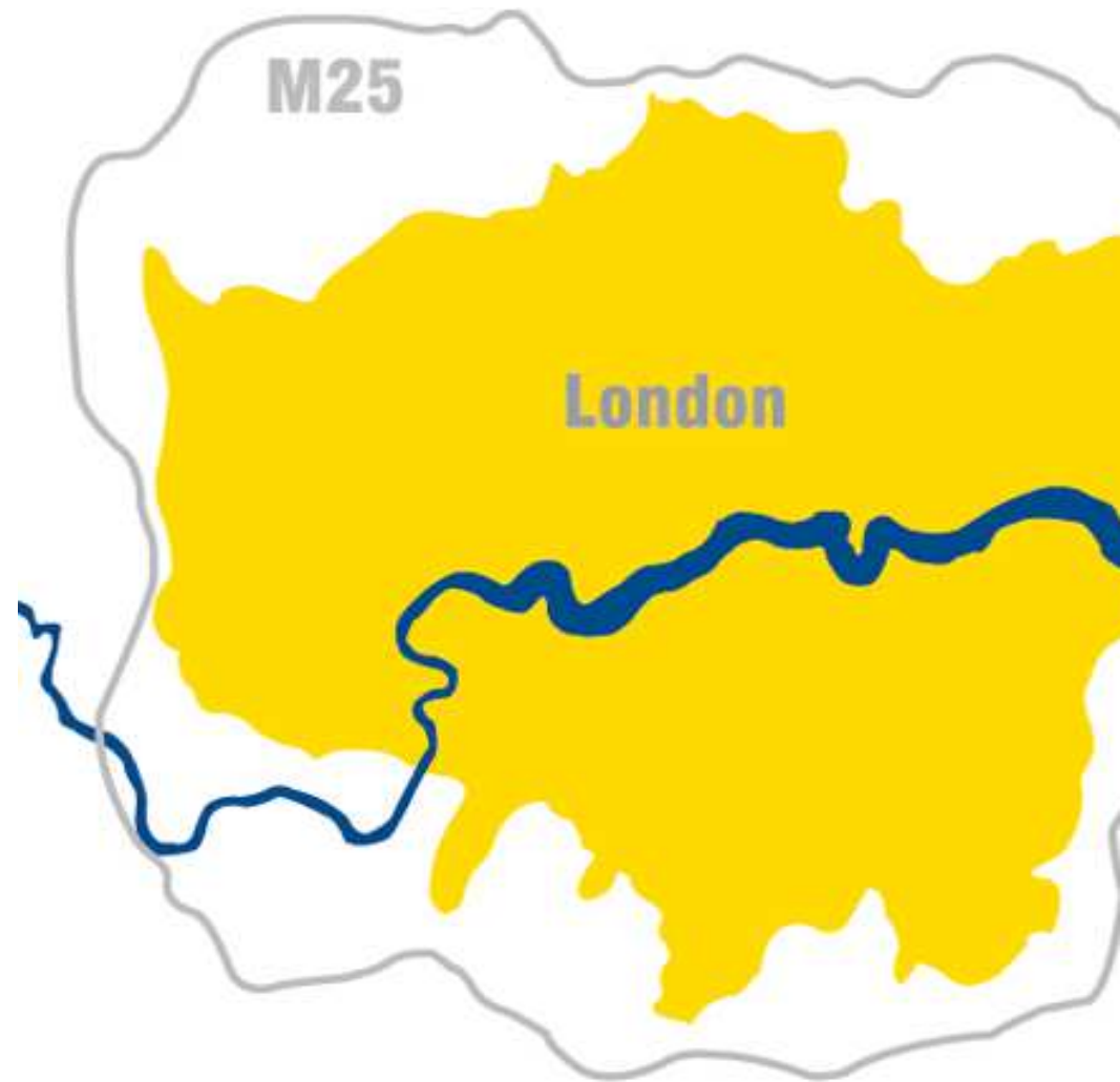
Map of Thurrock.