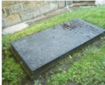
Ledger - Flat