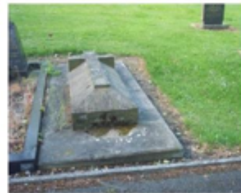
Ledger - Shaped