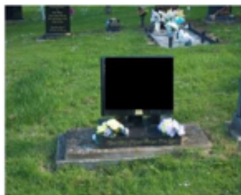
Book and Rests