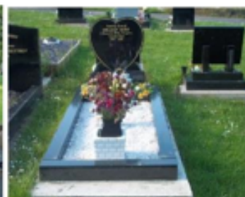
Headstone and Kerbset