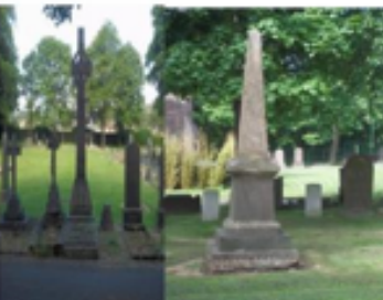
Pinnacles / Obelisk