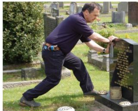
Correct testing stance - Smaller memorial